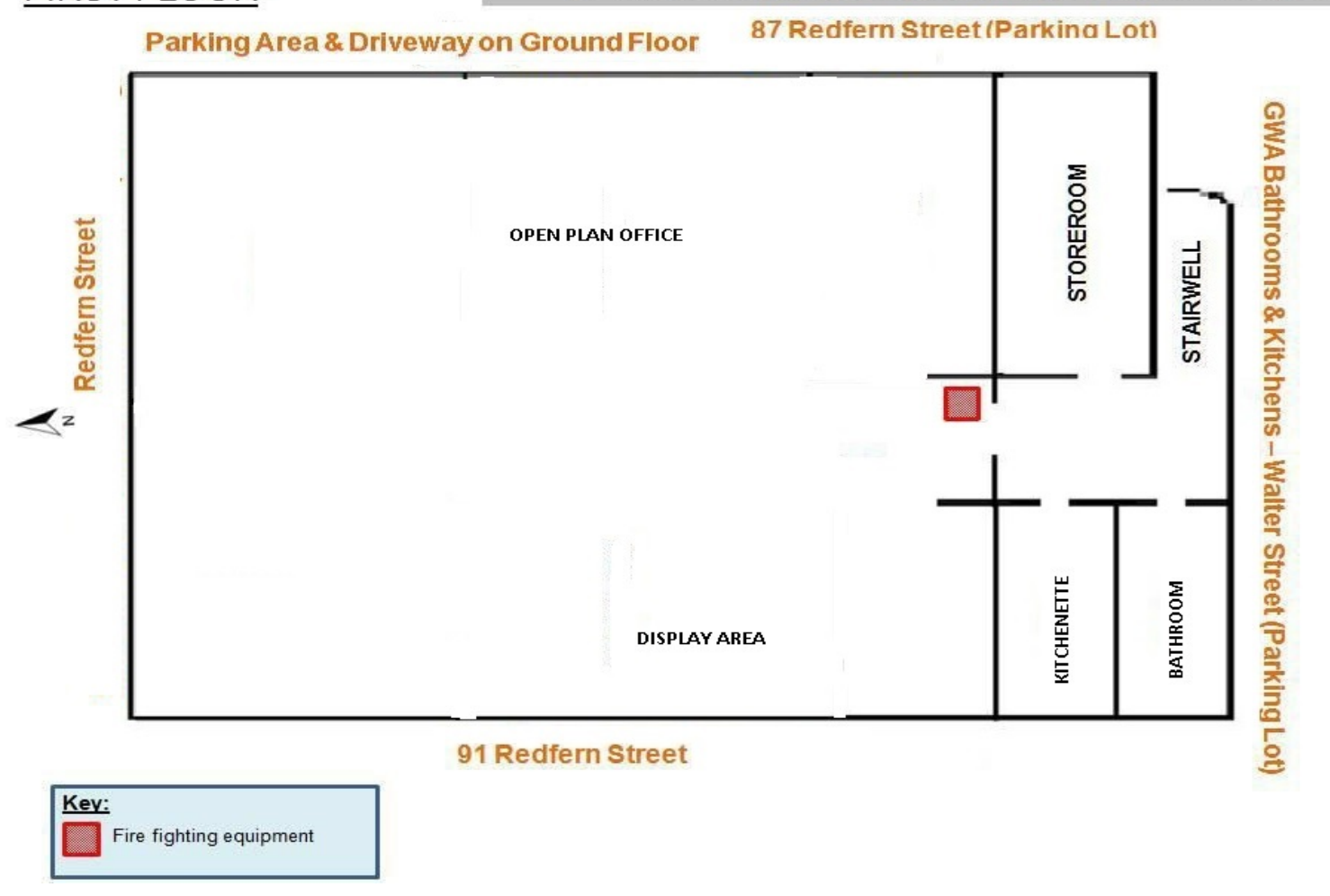
Figure 2 First floor map of TMS premises

Tank Management Services - 89, Redfern Street, Wetherill Park, NSW